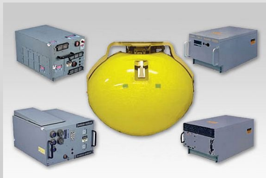
AN/APY- 10 Maritime/Overland Radar