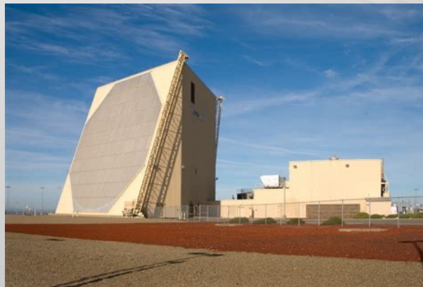
AN/FPS-132 Upgraded Early Warning Radar