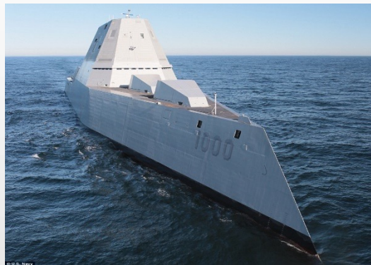
Zumwalt Class Destroyer